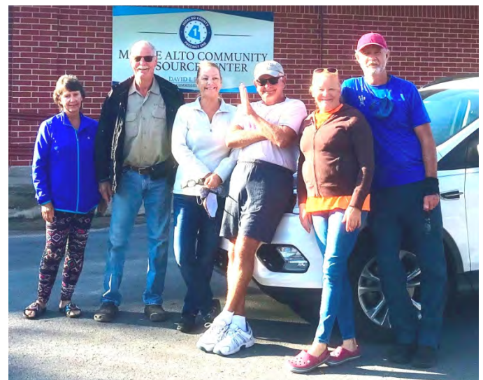
Dropping items off at Monte Alto