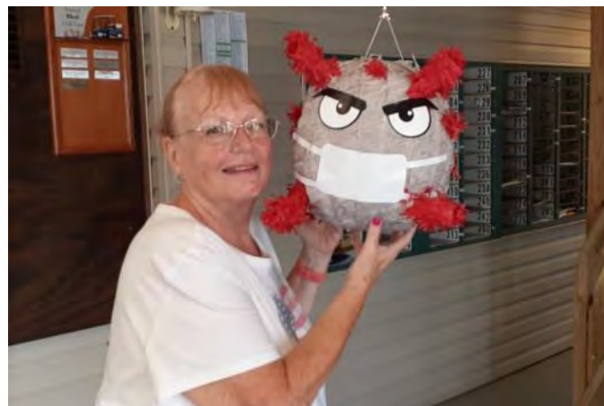
That nasty Corona must die!