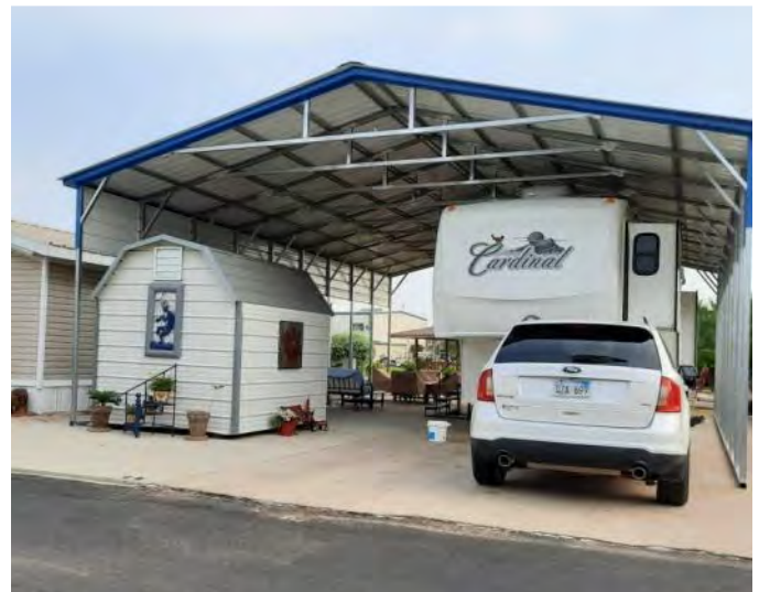
Another new Canopy at Natures