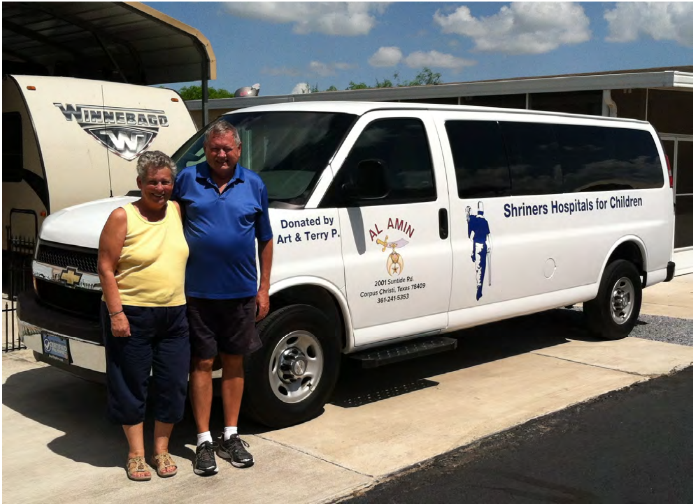
Ready to Transport Children to LaFeria and Houston