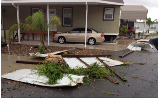
Pieces of Fence Scattered Everywhere

BUT, in spite of all the damage, we are so very thankful. NO ONE was hurt. The potential for personal injury is frightening so we truly give thanks that there was not even a scratch on anyone.