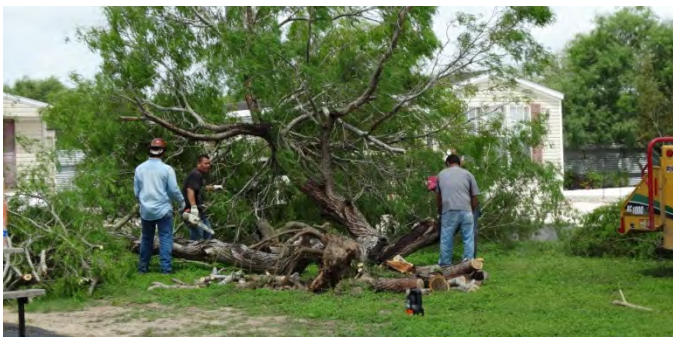
Another Tree toppled by the Storm

The fence is in the process of being put back together. Instead of wood 4 x 4's on the front fence, we are using steel 4 x 4's which we hope will be better able to withstand extra strong winds. As added insurance the posts are being filled with concrete using a nifty funnel that Denny created for the job!