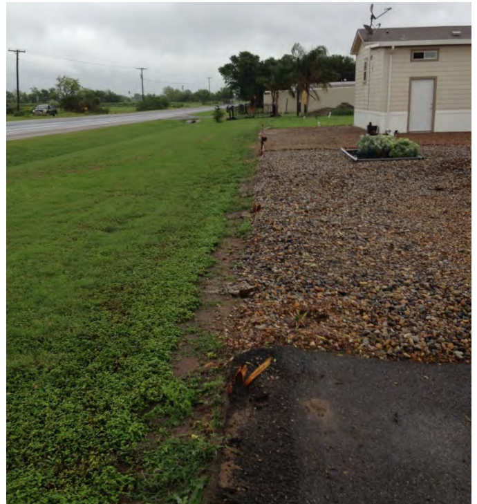
Our Front Fence is GONE!

five big trees were ripped out of the ground. Natures was a sad, sad mess.