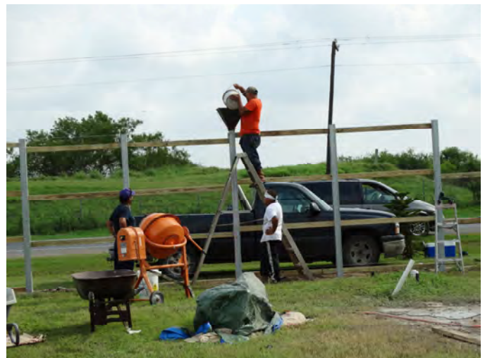
Using Denny's Funnel to fill the Post with Cement

The contractor we hired to cut up the uprooted trees, and cut out the damaged limbs in other trees has completed that part of our storm damage clean up.