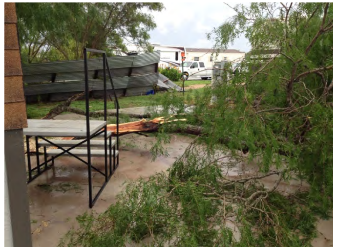
Broken Limbs and Damaged Fences