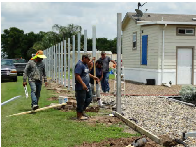
The Fence Progresses

We cannot wait for the fence to be completed so that we can have our privacy again!