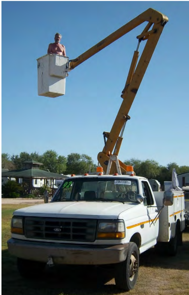
Big Boys have Big Toys!