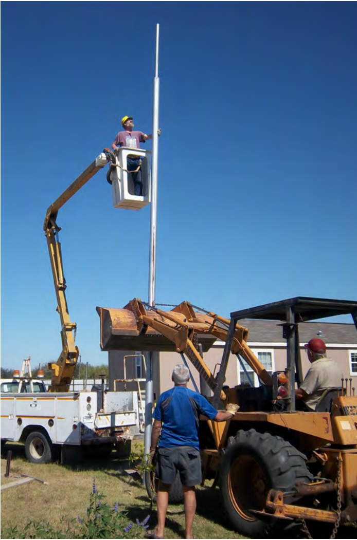
Up goes the Pole for the new WiFi System