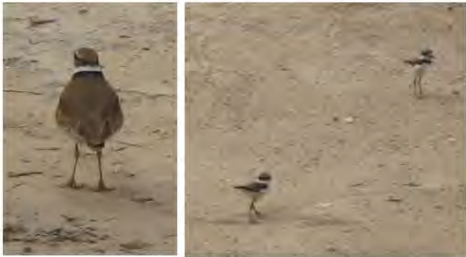
Mommy Killdeer and Babies.

(Daddy was keeping the photographer at a safe distance!)