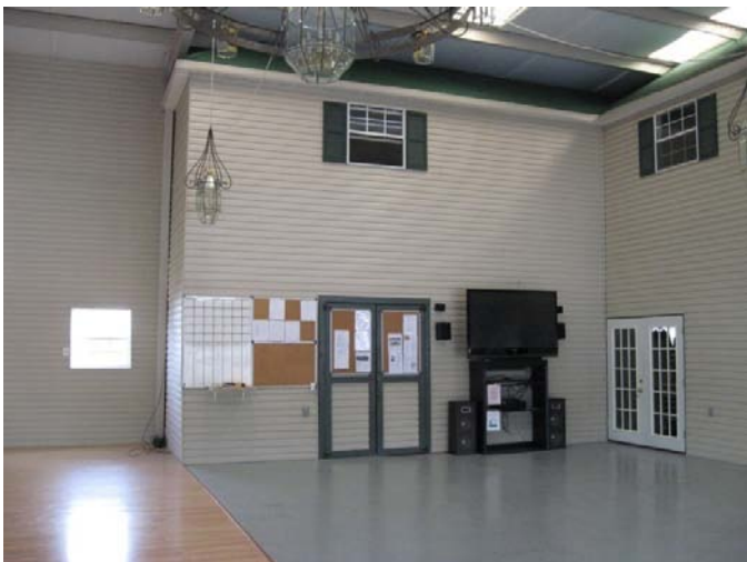
The Finished Product!

With an insulated clubhouse, it was now time to put in the large gas overhead heater for the winter months. Our wonderful volunteers did this, so when it is chilly outside and you are enjoying the warm clubhouse, please remember the folks who worked hard in over