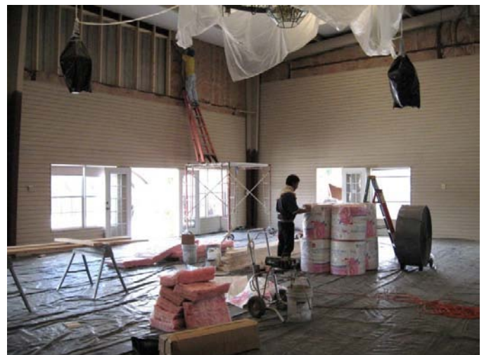
Insulating and putting up vinyl siding in the Clubhouse

This project is now complete, and we think that the clubhouse looks awesome!