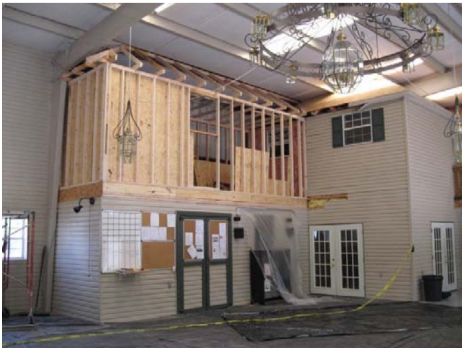
Work in Progress – The Carriage House Loft

While the contractor was here, we also added an upstairs storage area above the Carriage House which, amongst other things, will house the decorations for our dances and special events. Not only will this upstairs storage area provide more space for the decorations, but it will make them easily accessible. Once again our wonderful volunteers have stepped up to the plate, and have installed shelves so that this area can be used to its full potential. No more climbing up on ladders and balancing storage tubs on the ceiling beams!