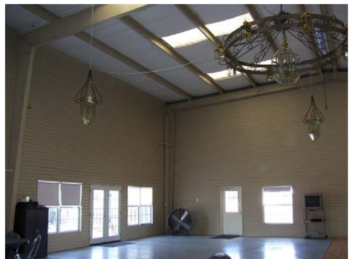
The Finished Product!