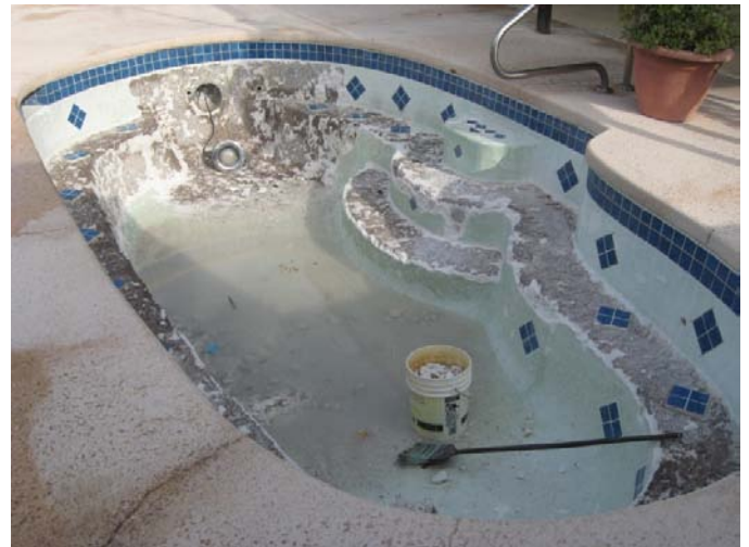
The Hot Tub – Work in Progress